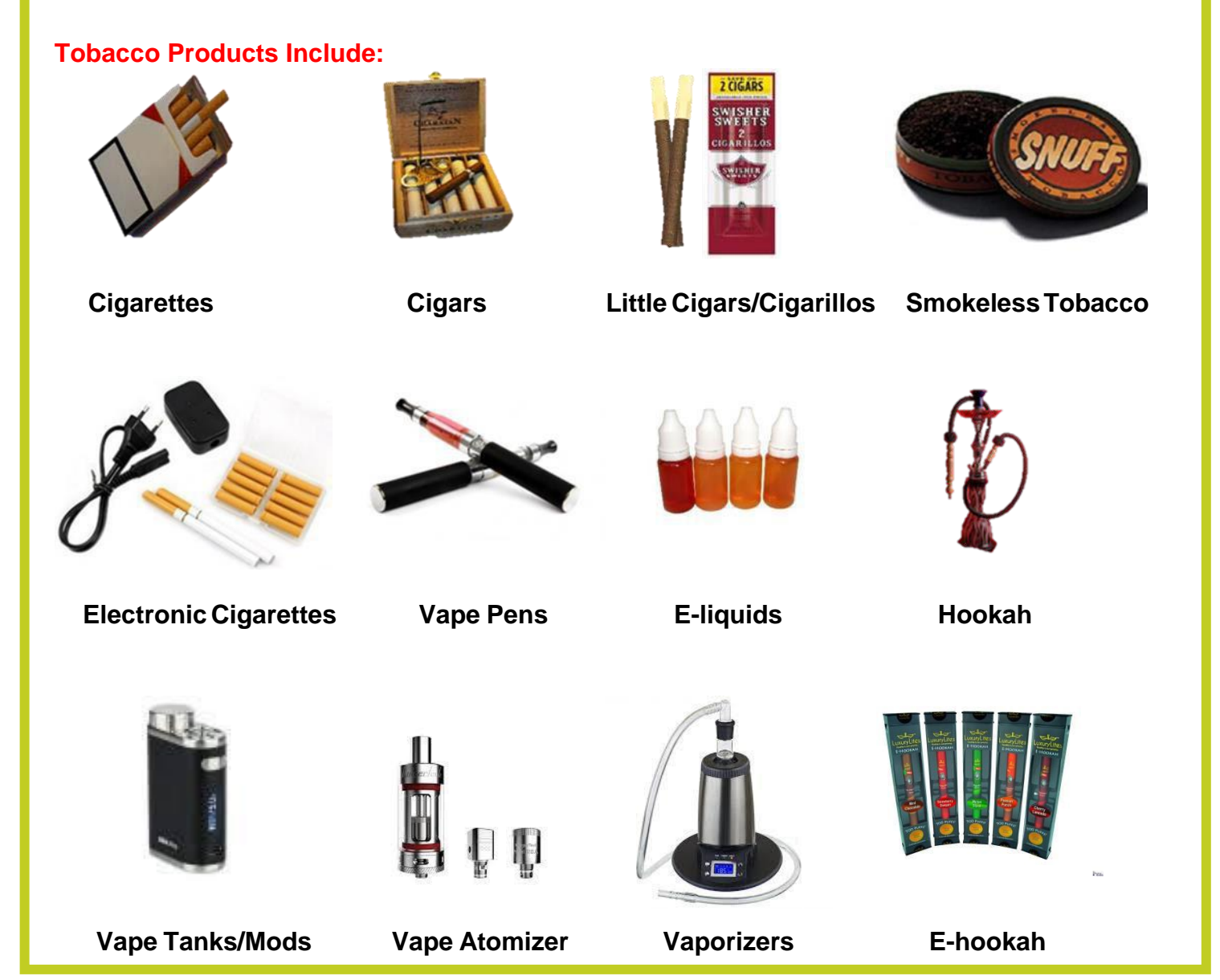
California Department of Public Health

California state law expanded the definition of tobacco products. A tobacco product is (1) any product containing, made, or derived from tobacco or nicotine that is intended for human consumption, (2) any electronic vaping device (whether or not it contains nicotine), or (3) any component, part, or accessory of a tobacco product, whether or not sold separately. For example, e-cigarettes, atomizers, vaping tanks ormods, and"e-liquid" or "e-juice" are tobacco products. But products like nicotine patches that the U.S. Food & Drug Administration has approved as cessation products or for other therapeutic purposes are not included. [Business and Professions Code Section 22950.5 (d)]